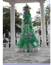
Christmas tree of environmental awareness made of plastic bottles, plaza in the historical center of old Panama City, Panama. December 2010.